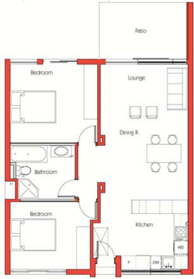
Unit Type A