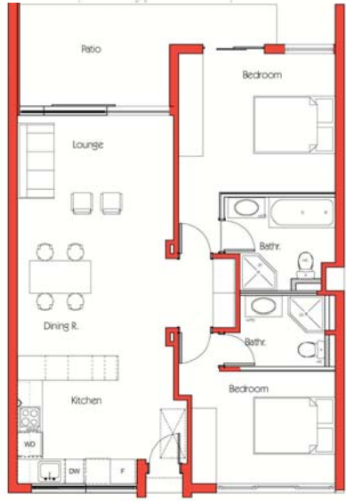
Unit Type B